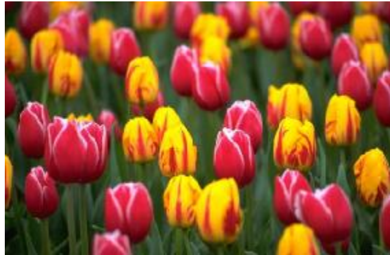
Signs of new life. Who doesn't feel uplifted at the sight of spring's first offering?

new layer of mulch; it will protect the soil and feed it in preparation for spring planting.