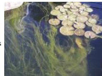
String algae—finally a thing of the past?